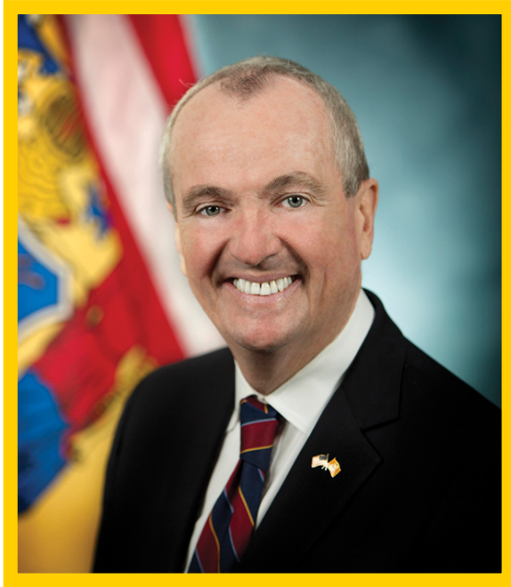
Phil Murphy Governor