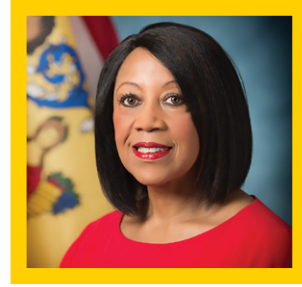
Sheila Y. Oliver Lt. Governor